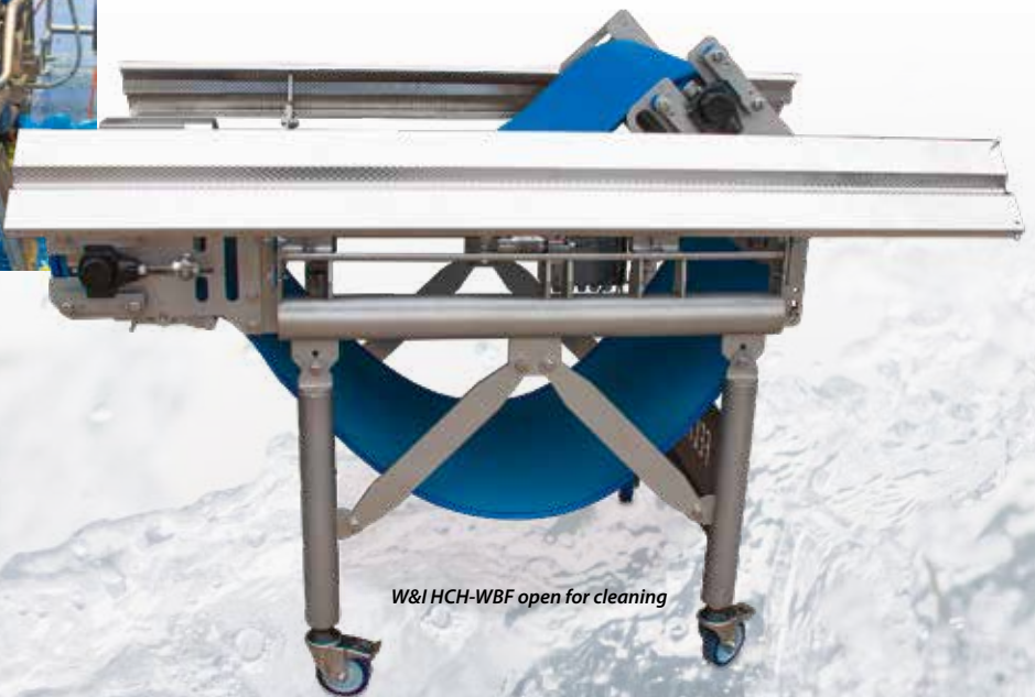
W&I HCH-WBF open for cleaning